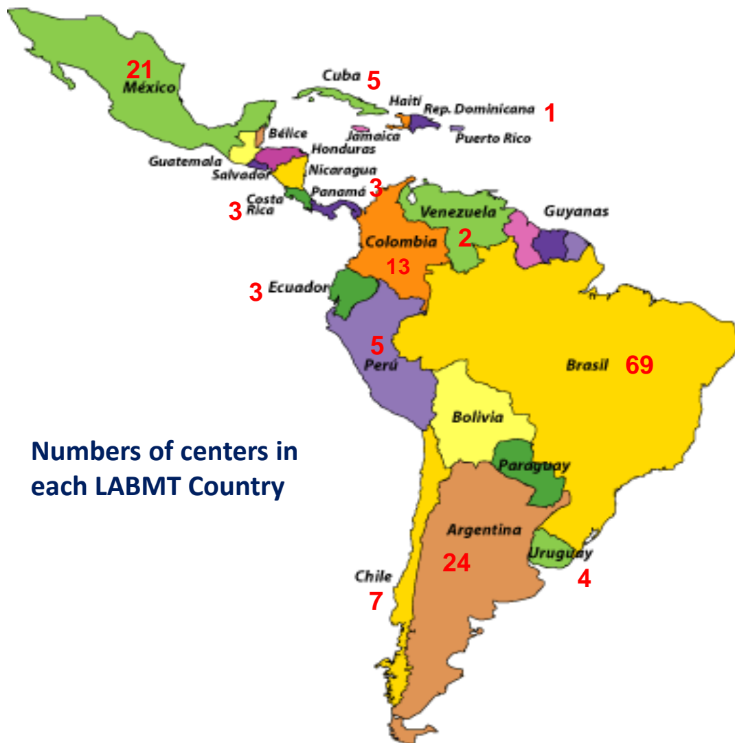
Numbers of centers in each LABMT Country