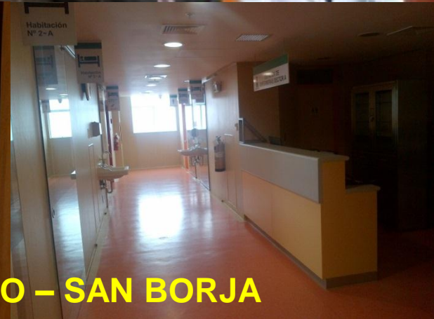
INSTITUTO NACIONAL DE SALUD DEL NIÑO – SAN BORJA